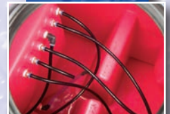
Built-in water baffles for stability in your vehicle