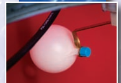
Ballcock for shut-off