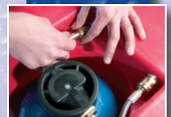
Quick-release Connectors for ease of use