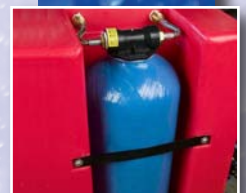
Vertical Resin vessel