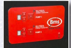
Precision controls for ease of use