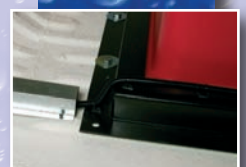
Securely mounted through floor to chassis