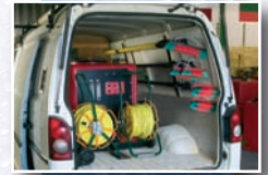
Organised & Secure for simplicity & safety

Enables easy access to inlet and outlet ports allowing you to operate and fill the system with the van doors locked for security purposes