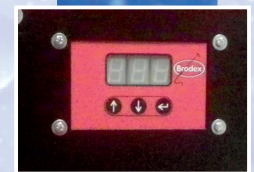
Precision Controls for ease of use