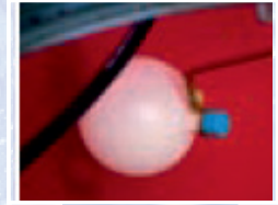
Ballcock for shut-off