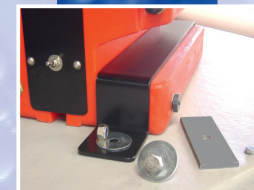
Securely mounted through floor to chassis