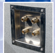
Optional extra External van mounted access point