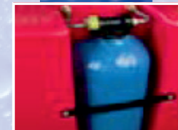
Vertical Resin Bottle