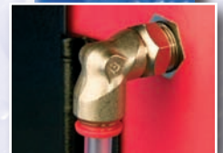
Top-quality metal fittings