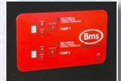
Precision controls for ease of use